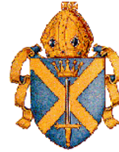
Church of England