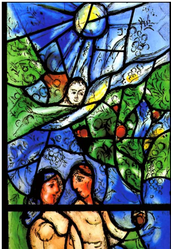
Adam and Eve, Marc Chagall

Some Pharisees came and tested him by asking, "Is it lawful for a man to divorce his wife?" "What