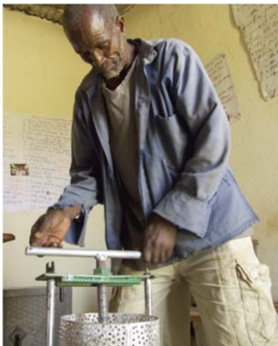
A machine for processing honey

Ethiopia: ending hunger Ethiopia was tragically brought to the world's attention by the devastating famine of the 1980s, when hundreds of thousands of people died. Since then, the country has often been used as shorthand for poverty. But to label Ethiopia as a hopeless case, a place where poverty and hunger are inevitable, would be a scandal. It has a rich and ancient culture, of which its people are understandably proud. While drought in Ethiopia seems like a certainty, disaster is not. In 2011 east Africa faced its worst drought in 60 years, but thanks to work by the Ethiopian Government, Christian Aid's partners and others, communities had become more resilient by then, so the outcome was that very few lives were lost in Ethiopia, even though this was a far worse drought than in the 1980s. This long-term work is helping people to grow more in the good years, to store or sell the surplus to ensure something is put by for the bad years and to invest in their future. The ultimate aim is that these communities will not merely survive in the future, but thrive.