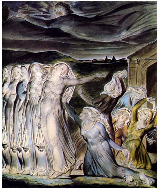
The Wise and Foolish Virgins, William Blake 1826

After that, we who are still alive and are left will be caught up together with them in the clouds to