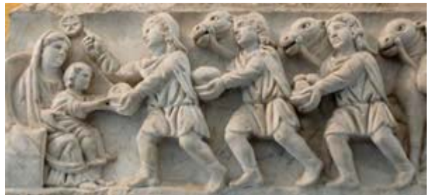
The Adoration of the Magi from a Roman sarcophagus, 4th century. From the cemetery of St. Agnes in Rome

Jesus spoke again to the people, He said, "I am the light of the world. Whoever follows me will never walk in darkness, but will have the light of life."