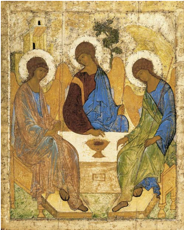
The Trinity by Andrei Rublev

started in that most ordinary of human experiences — a broken love affair.