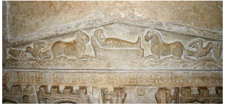
Detail from the side facing the apse of the so-called "Sarcofago di Stilicone" ("Stilicho's sarcophagus"), an Ancient Roman Christian sarcophagus dating from the 4th century. It is preserved beneath the pulpit of Sant' Ambrogio basilica in Milan, Italy.

Almighty God, you have given us your only-begotten Son to take our nature upon him and as at this time to be born of a pure virgin: grant that we, who have been born again and made your children by adoption and grace, may daily be renewed by your Holy Spirit; through Jesus Christ your Son our Lord, who is alive and reigns with you, in the unity of the Holy Spirit, one God, now and for ever. Common Worship, Methodist Worship