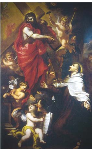
Jesus Christ Appears to St John of the Cross by Domenico Piola

You have cast a spell of longing over me, O Christ, and changed me with your divine yearning; but burn up my sins in immaterial fire, and make me worthy to be filled with delight in you, that, dancing, I may magnify your two comings, O Good One. St John Damascene (676-749)