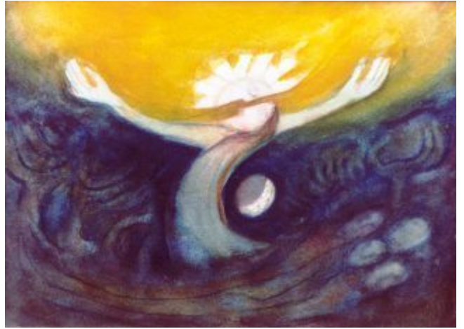
Gethsemane