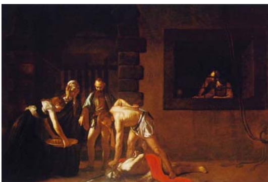
The beheading of John, Caravaggio

Whereas John's father had been part of the religious establishment as a priest in the Jerusalem temple, John fled the comforts and corruptions of the city for the loneliness of the desert. There he dressed in animal skins, ate insects and wild honey, and preached. Living on the margins of society, both literally and figuratively, he preached "a baptism of repentance for the forgiveness of sins" (Mark 1:4).