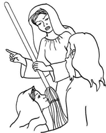
"Jesus Visits Mary and Martha." Luke 10:38-42

As Jesus and his disciples were on their way, he came to a village where a woman named Martha opened her home to him. She had a sister called Mary, who sat at the Lord's feet listening to what he said. But Martha was distracted by all the preparations that had to be made. She came to him and asked, "Lord, don't you care that my sister has left me to do the work by myself? Tell her to help me!" "Martha, Martha," the Lord answered, "you are worried and upset about many things, but only one thing is needed. Mary has chosen what is better, and it will not be taken away from her." (Reader: This is the Gospel of Christ - All: Praise to Christ our Lord Amen )