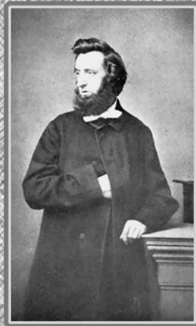
WILLIAM BOOTH IN 1859