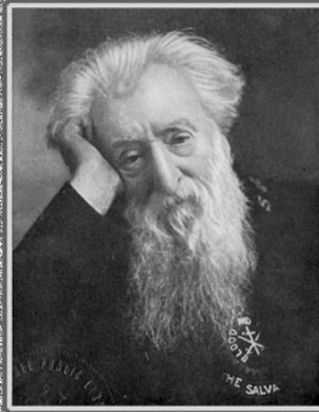
WILLIAM BOOTH IN 1907