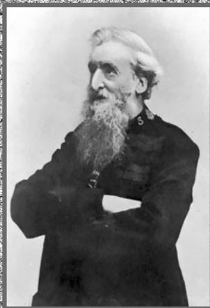
WILLIAM BOOTH IN HIS 70TH YEAR