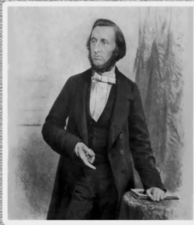
WILLIAM BOOTH IN 1856