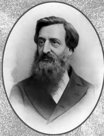
WILLIAM BOOTH IN 1879