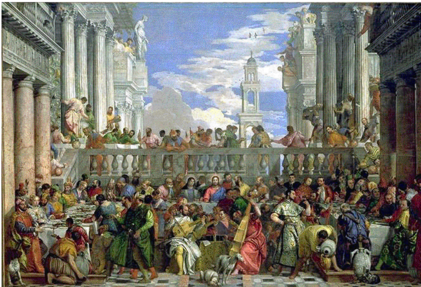
The Wedding Feast at Cana 1563 - Paolo Veronese (1528-1588)